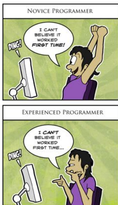
"A Bug's Life" by Luke Surl, CC BY-NC-SA

A- 90-92; A 93 or greater B- 80-82; B 83-86; B+ 87-89 C- 70-72; C 73-76*; C+ 77-79 D- 60-62; D 63-66; D+ 67-69 F less than 60 (Grades are truncated, not rounded) * (C or better required for majors)